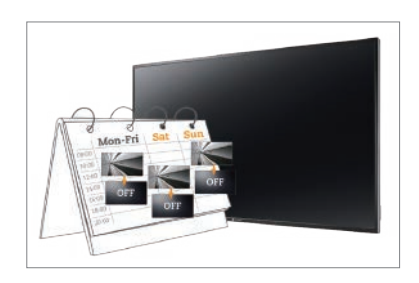
Built-in scheduler automatically activates and deactivates the PM-48 with designated input signal according to programmed schedules.