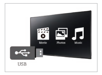
USB Playback for easy multimedia content presenting